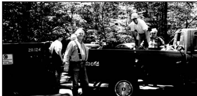
Cleanup Day 2001 / Can you identify these residents?

Assistant Fire Chief Ugaste presented the fire department call volume within the Village of Riverwoods for the period February 1 through February 15, 2010. There were 5 fire calls, two car accidents, 16 paramedic calls and two other calls for a total of 25 calls for the period. Year to date there were 48 calls.