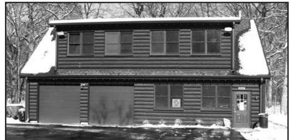
Our police department operates out of this rustic log style structure located next to Village Hall on Portwine.

Mr. Bushhouse provided a cost per square foot range of $214 - $233. Adding landscaping, site work and 15% for a general contractor, Mr. Bushhouse estimated the cost to be $1.7 million - $1.9 million.